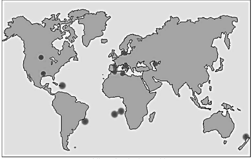
Iridium sites in the world

Layers of the Earth's crust with an increased concentration of carbon and iridium are very rare. Iridium layers are found for example in Denmark, Italy, Spain, Tunisia, Morocco, followed by New Zealand and North America, where the film thickness goes up to 40 centimeters. It is assumed that the appearance of iridium could be due to very poor soil sedimentation in a period when the concentration of iridium, which is constantly in minute quantities falling from space to Earth, was increased. Minor amounts of iridium are found in the ashes from huge volcanic eruptions. The emergence of iridium in the soil, however, is most likely in the cases after impact of falling of a celestial body to Earth, when in extreme conditions they disperse larger amounts of this element. Iridium sites around the Mediterranean Sea (Italy, Spain, Tunisia and Morocco) indicate a strong possibility (probability) of one or more asteroids falling within the Mediterranean iridium circle, that is the space in the Mediterranean Sea .